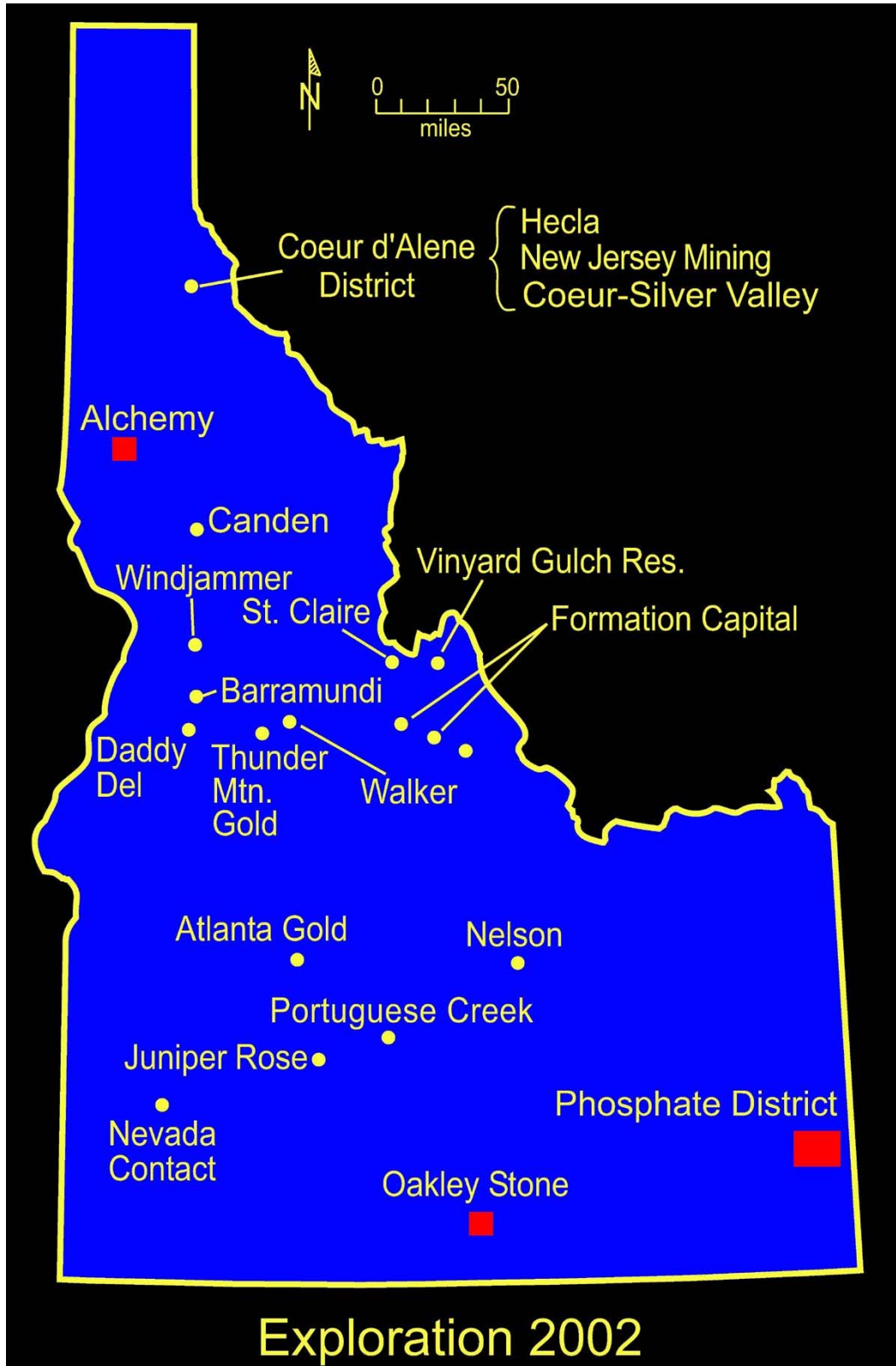
Figure 1. 2002 Exploration map for Idaho